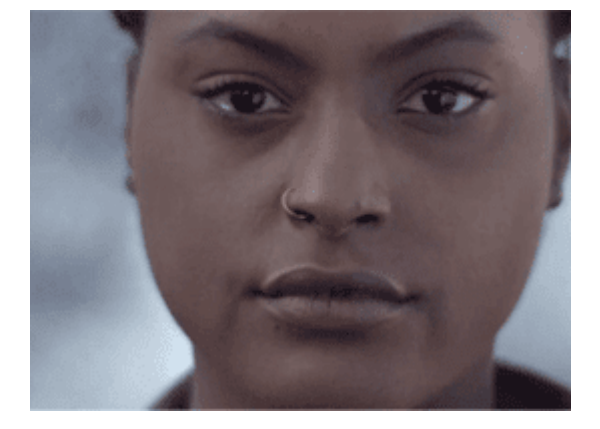
Ontario's new LTC Minister has his work cut out for him. LTC workers of all classifications are traumatized after working through what can only be described as a humanitarian crisis.