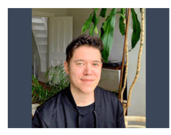
Unifor's analysis of labour market trends since the start of COVID shows that Indigenous peoples felt the economic downturn more acutely than non-Indigenous Canadians.